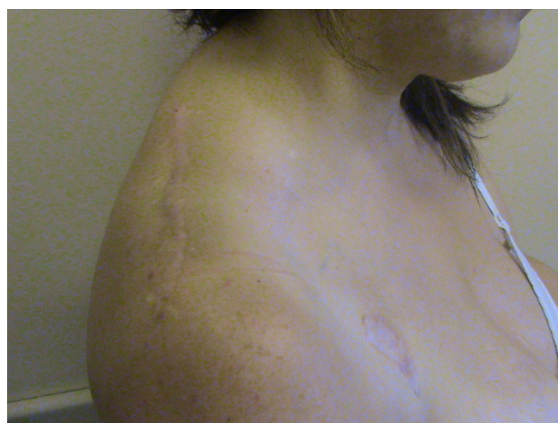
Figure 4. Post-treatment view of the patient